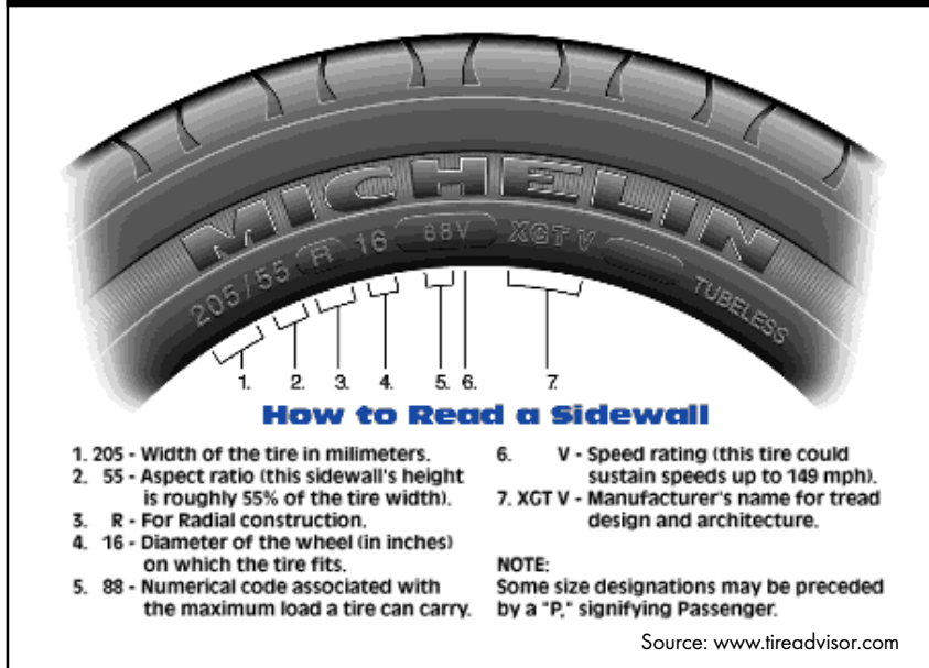
FIGURE 2: KEY INFORMATION FOUND ON TIRES

■ ROLLING RESISTANCE – We assessed rolling resistance for 51 different currently available tire models in four sizes. These models represent only a fraction of the hundreds of models currently available today, but were chosen because previous tests or manufacturing claims indicated they might have lower than average rolling resistance or other distinctive performance features (best wet traction, high overall satisfaction, etc.). The models we tested had rolling resistance coefficients ranging from 0.0062 to 0.0152 (see Figure 3). We recommend models with an RRC of 0.0105 or less, recognizing that low values are somewhat more difficult to achieve on larger, heavier tires than on smaller, lighter weight models.