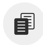
Safety Data Sheets

Our standards are referenced by the leading green building certification programs.